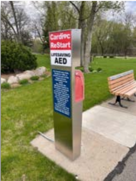
Double sided install