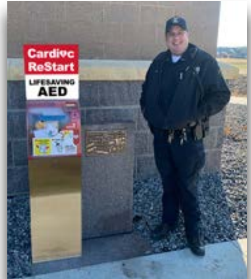
Single sided install against a building/structure