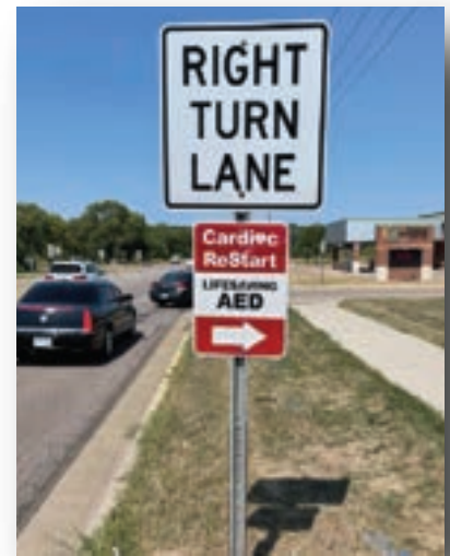
Text & Image